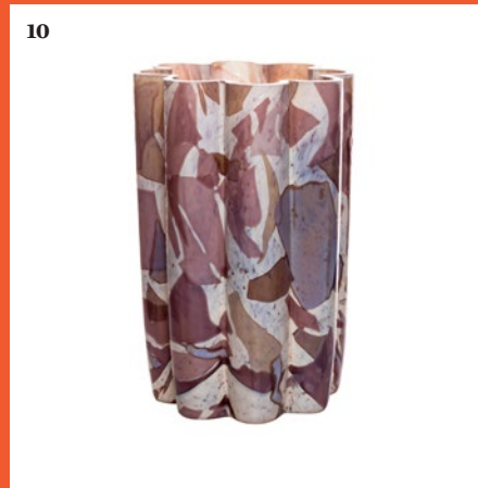
1 'Terra' mixed clay side table by Luca Erba for Collection Particulière, £3,980, Monologue (monologuelondon.com) 2 'Socle' dining table in dark fumed oak, £10,650, Matthew Cox (matthewcox.com) 3 'Jute Cross' rug in 'Black', from £225, Nordic Knots (nordicknots.com) 4 'Daphne' floor lamp in French brass, £1,530; 'Daphne' lampshade in 'Clove Linen', £529, both Porta Romana (portaromana.com) 5 Anchor Memory 33 artwork , £65 (unframed), Adriana Jaros (adrianajaros.com) 6 'Arbol' light by Michael Ruh, £11,500, The New Craftsmen (thenewcraftsmen.com) 7 'Black Loop' chair , £740, Fred Rigby Studio (fredrigbystudio.com) 8 Vintage tall wooden totem (H160cm), £2,850, Monument (monumentstore.co.uk) 9 '2 Step' cushion in 'Gold', £100, Hadedá (hadedá.co.uk) 10 'Amethyst' Murano glass bucket vase by Nougat, approx £240, Stories of Italy (storiesofitaly.com)